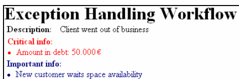
Figure 6. EHW displaying alert messages at the top

Concerning the “Edit exception classification” action in step “Exception description”, the Web page utilized to edit the exception classification is similar to the “Edit exception info” page shown in Figure 4 and is not shown. Another functionality is that the user may share alert messages with attached files with the other persons involved. These alert messages may be classified as critical (displayed in red) or important (displayed in blue). Figure 6 illustrates how the alert messages are displayed in the EHW page. If none of these classifications is selected the message is only displayed inside the component. Another web page enables changing the workflow affected instances.