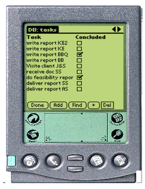
Figure 3 – To-do list on a participant's database

We should mention that this prototype was developed from a previous prototype that we built to integrate PDA with an Internet-based Electronic Meeting System (also built by us). In fact, the prototype described in this paper is the result of removing functionality to the previous one. While experimenting the PDA/EMS integration mechanism, we found out that the added value was resulting from the coordination support provided by PDA rather than integration with EMS. More details on the previous prototype can be found in [29] [30].